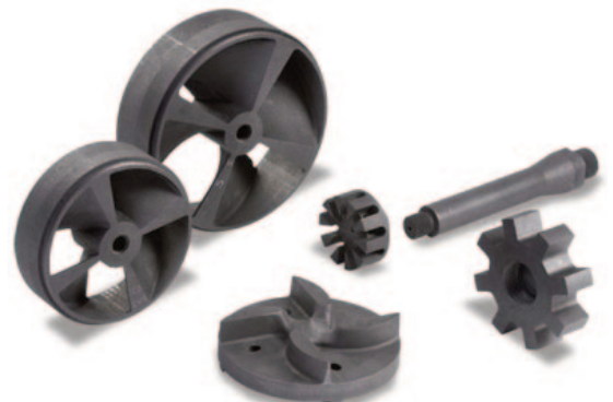
Graphite rotors, impellers and shafts for aluminum gas injections systems.